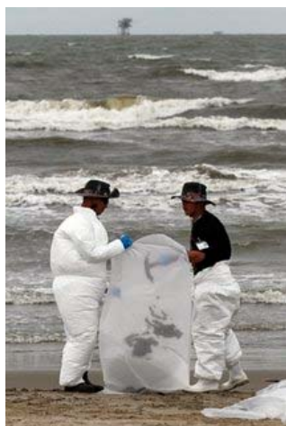
Workers shovel and bag sand oiled by April's Deepwater Horizon oil rig explosion and spill on a beach ...

The oil's arrival in Texas was predicted Friday by an analysis from the National Oceanic and Atmospheric Administration, which gave a 40 percent chance of crude reaching the area.