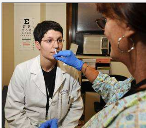
Tannen Maury / EPA