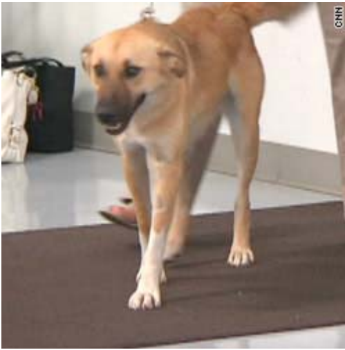
Target saved U.S. soldiers in Afghanistan